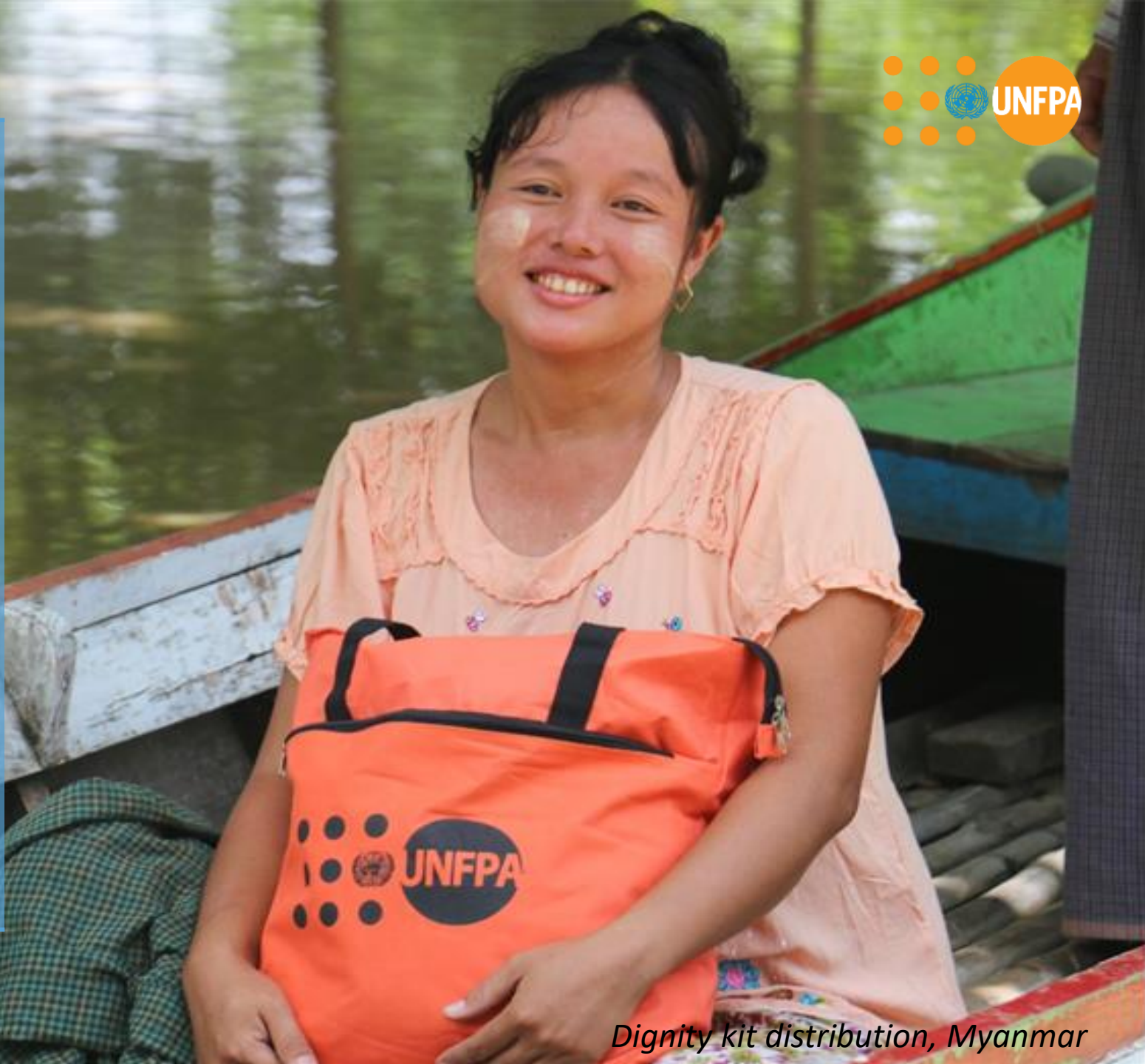
Dignity kit distribution, Myanmar

Branwen Millar UNFPA Asia Pacific Regional Office