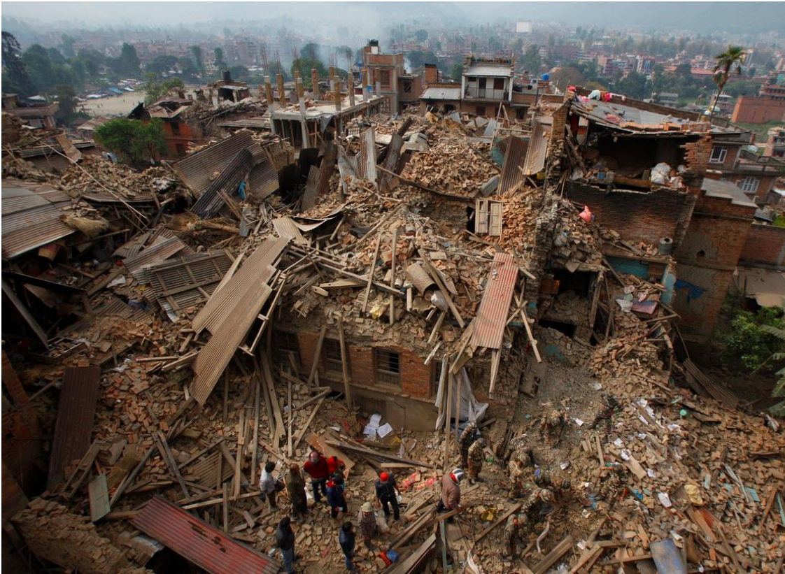
Left: Devastation from the earthquake Right: An 8 months pregnant woman with her kids, receives UNFPA dignity kit during response, Nepal

Prepositioned supplies were the only supplies UNFPA had on the ground for four weeks as Kathmandu's single airstrip was used for all humanitarian supplies arriving in country.