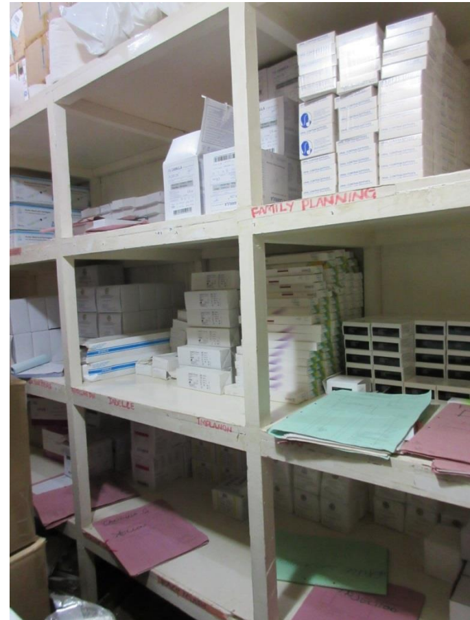
Improved Salima District Hospital store room