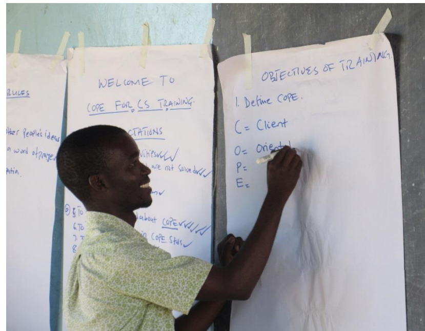
COPE for CS exercise, Maganga Health Center, Salima