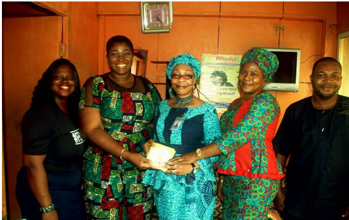
Ask4FP, Cote d'Ivoire